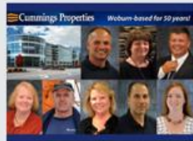
Cummings Properties LLC Woburn-based for 50 years!